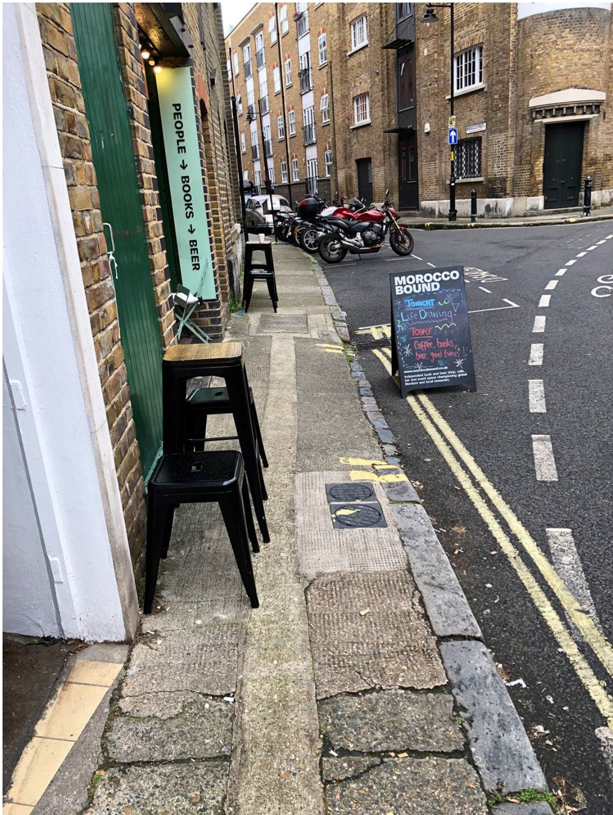
Pavement outside Morocco Bound, 1a Morocco Street, London SE1 3HB